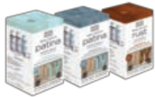
2 oz. kit