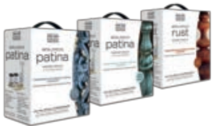
8 oz. kit * Sealer included in kit