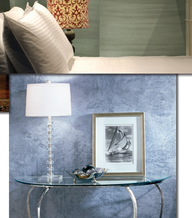
CLOCKWISE FROM TOP LEFT: Shimmerstone (Tinted Base), Metallic Plaster (Dry Sage), Metallic Plaster (Ice Blue)

Residential • Hospitality • Restaurants Casinos • Theatres • Corporate Offices